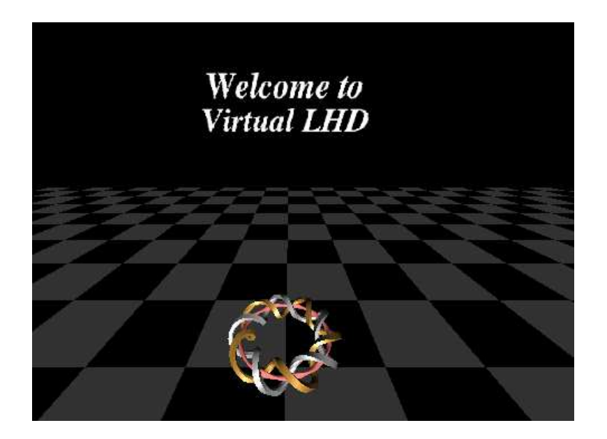
Figure 1: Virtual LHD world seen in CompleXcope . It is actually projected onto three large stereo screens (10 \times 10 feet^2) of two walls and the floor of the CompleXcope room. The LHD helical coils are seen under the foot.