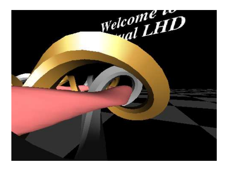
Figure 2: Helical coils and a pressure isosurface. By touching a level bar (not seen) by the wand , the isosurface level is interactively controlled. The wand is a portable controller with buttons.