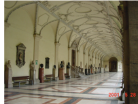
Fig. 1. Library of Vienna University.