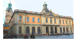
Fig. 2. Nobel Museum in Stockholm.