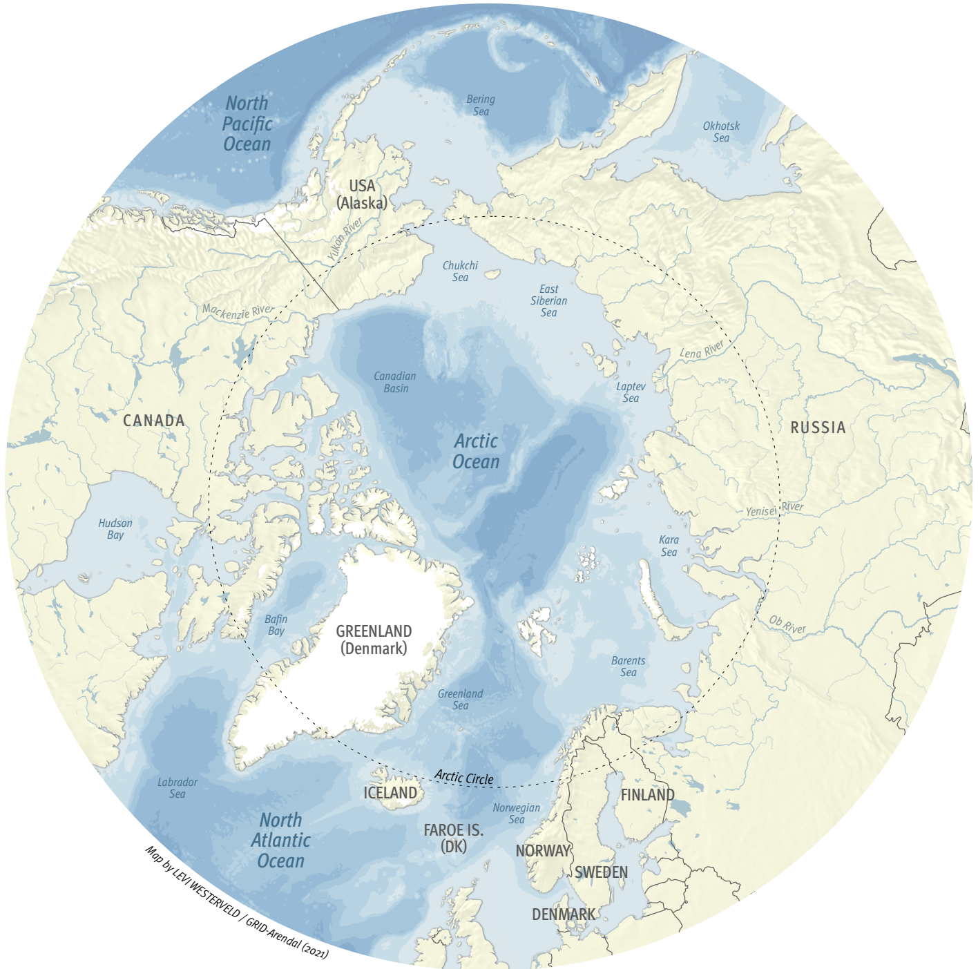
Figure 2: Map of the Arctic

river basins, and other areas that are connected to the marine environment.