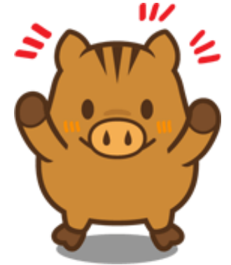
Mascot of Kobe Univ URIBO