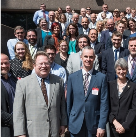
Some of the delegates to the SCTF.

SCTF (/index.php/en/component/tags/tag/34-sctf)